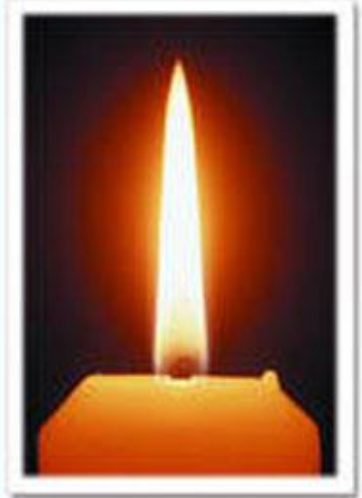
Shukr Noor-e-Karim