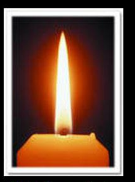
Shukr Noor-e-Karim