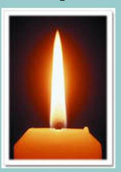
Shukr Noor-e-Karim